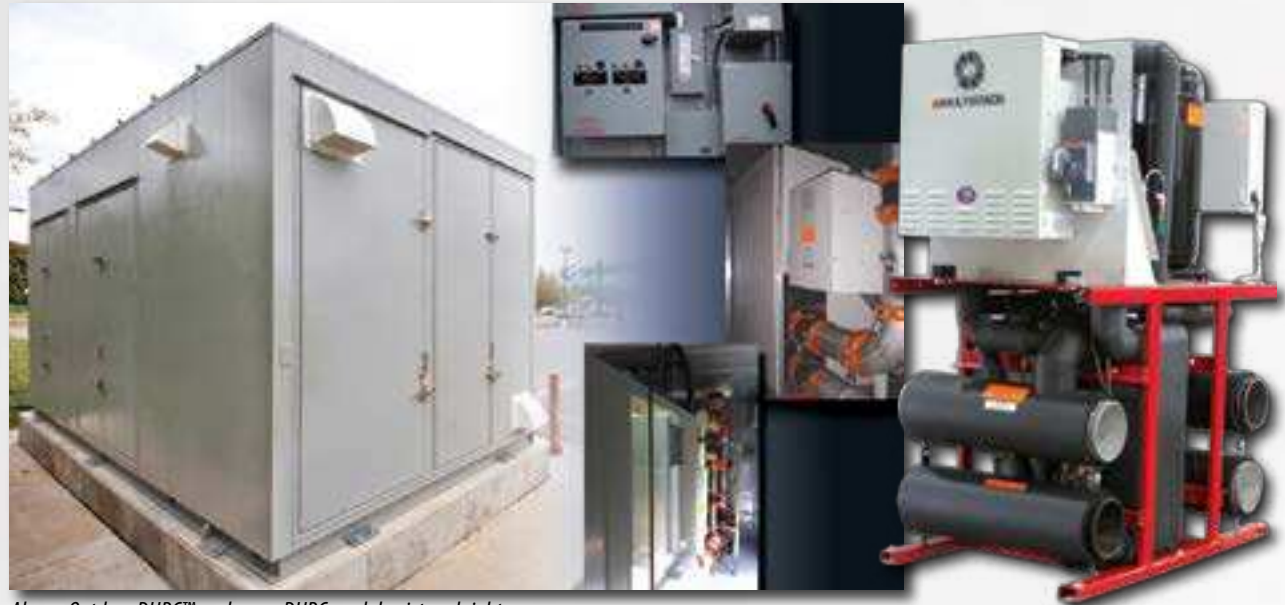
Above: Outdoor DHRC™ enclosure; DHRC module pictured right.

Using heat from the DES offsets natural gas used to heat water in the existing PRC boilers. This generates immediate savings because the reclaimed effluent energy is essentially free. In addition, greenhouse gas emissions are greatly reduced by replacing natural gas combustion with clean BC hydroelectricity. Multistack DHRC units are ideal for application in hospitals, data centers, and hotels that have a constant cooling load from computer rooms, labs, and storage areas while requiring heat for hot water, processing, and sterilization. With a DHRC system, building owners can save money and significantly reduce carbon footprint. DHRC units can generate hot water from 110-180°F and have proven to be three times more efficient than a gas boiler.