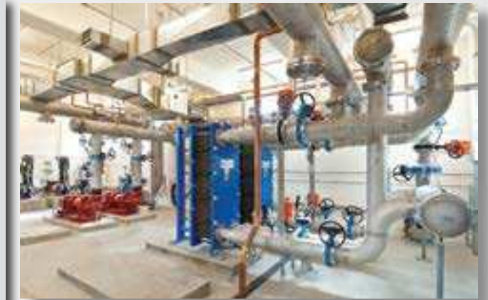
Saanich Peninsula Panorama Recreation Centre mechanical room.

“The Multistack control system allows the DHRC chiller to extract as much heat as possible from the wastewater system. Traditional heat recovery chillers will trip out with colder water and that has been a problem on other projects with other chillers that use controls less sophisticated than Multistack’s”