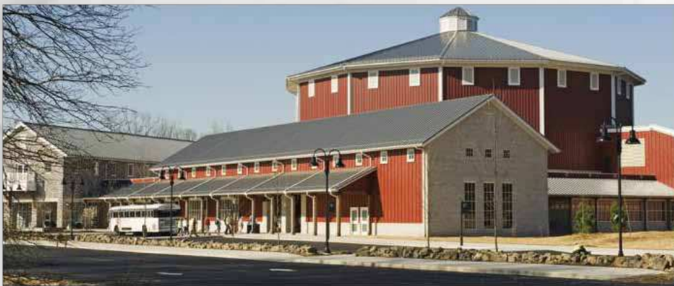
The Gettysburg National Military Park Visitors Center and Museum receives more than 1 million visitors each year. In 2010 it was awarded USGBC LEED Gold certification due to its energy-efficient geothermal HVAC system and other sustainable building design features.