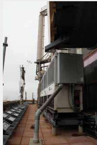
The modular air-cooled Airstack™ chillers are installed on the 81 st floor exterior setback.

“The compact, modular design of Airstack units saved significant dollars in rigging and labor expense and avoided potential delivery and installation delays”