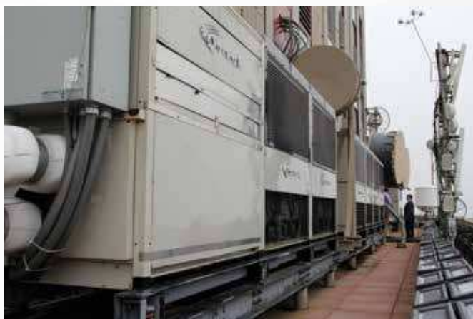
Six 30-ton modules provide 180 tons of reliable, redundant cooling capacity for areas of the 80 th and 86 th floors at the Empire State Building.