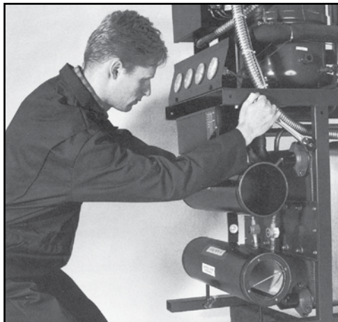
Figure 1, Removing header from heat exchanger.

CAUTION: Be careful not to let the electrical connections get wet. Remove the VICTAULIC COUPLINGS and HEADERS (Figure 1).