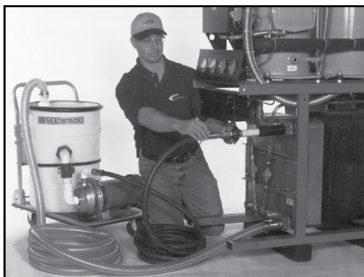
Figure 3, Inserting FlushGun into heat exchanger.

NOTE: FlushGun kits must be purchased separately.