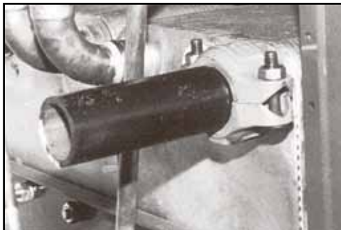
Figure 2, 6" Pipe connection.

NOTE: Install 6" long pipe to condenser or evaporator inlet, using one victaulic coupling and gasket that you removed from unit (Figure 2).